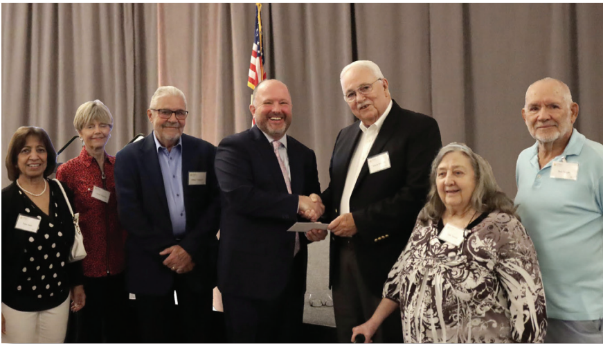
Bentley Village Foundation Awards The Literacy Council Gulf Coast $3,000

The information provided on this website is for general informational purposes.