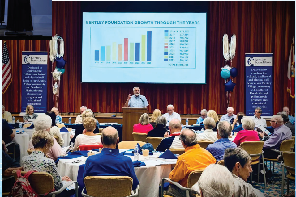
Celebrating 10 years of Foundation growth at Annual Meeting, and planning for the future.