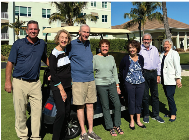
2025 Dollars for Scholars team

The Bentley Foundation is powered by people who care—people who bring their skills, creativity, and enthusiasm to support our mission. As we look ahead to another exciting year, we're inviting YOU to be part of the team that keeps our momentum strong.